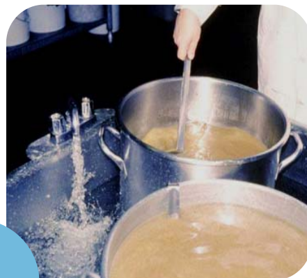
1 Ice Bath