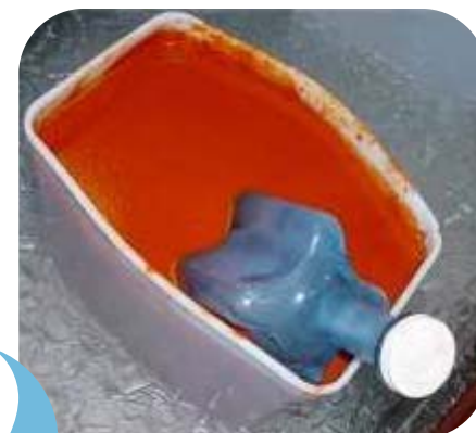
2 Ice Wand