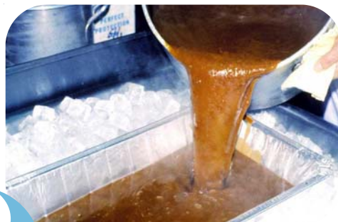
3 Shallow Pans (not deeper than 2 inches)