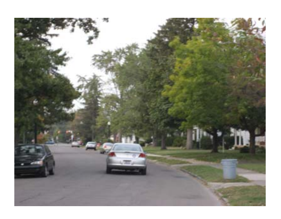
Binns Blvd is a residential street but has a lot of traffic and speeding