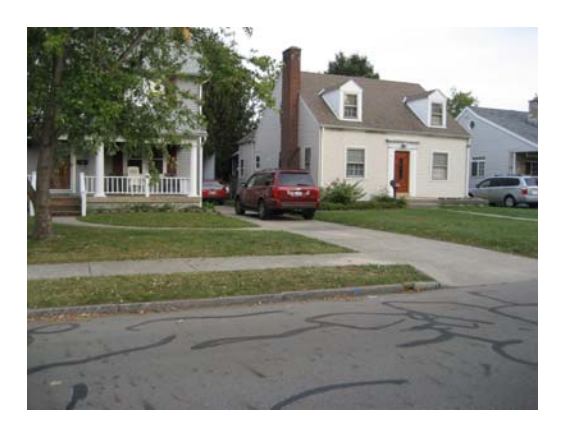
Beautiful homes of Wilshire Heights