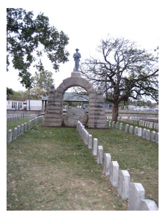
Camp Chase Confederate Cemetery was a Civil War camp

This report will be used to create walking maps through the neighborhood. The mile-marked maps will highlight neighborhood features, safe paths and destinations. The report will also be forwarded to City of Columbus departments that can assist neighborhoods in addressing their needs.