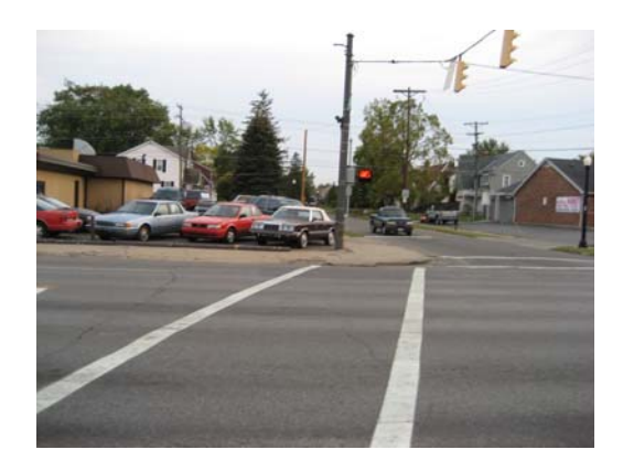
Intersection of Sullivant and Binns Blvdresidents would like more opportunities to cross Sullivant and more pedestrian friendly features.