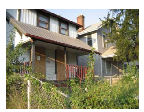
Absentee property owners do not take care of their property.

This report will be used to create walking maps through the neighborhood. The mile measured maps will highlight neighborhood features, safe paths and destinations. The report will also be forwarded to City of Columbus departments that can assist neighborhoods in addressing their needs.