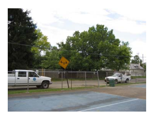
Playground sign is on the Karns Park property, not before to warn drivers they are approaching a park.