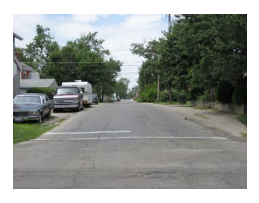
North/south street do not have sidewalks.