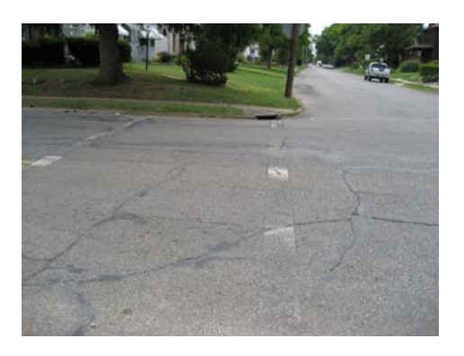
Faded crosswalks, children need to cross this intersection to get to school or the bus.