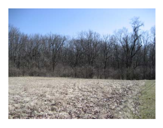
Land designated for a new park in the community.