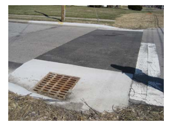
Sewer grate at the corner of Penrose Drive and Brentnell. The COTA bus stop is here and the disabled have trouble navigating the intersection due to the grate and current lack of sidewalks.