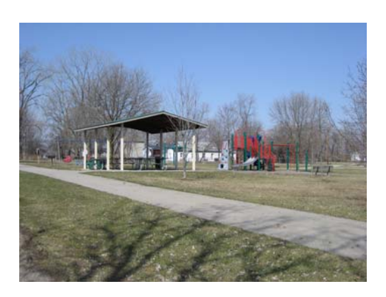
American Addition Park with a walking path, playground and pavilion.

This report will be used to create walking maps through the neighborhood. The mile-marked maps will highlight neighborhood features, safe paths and destinations. The report will also be forwarded to City of Columbus departments that can assist neighborhoods in addressing their needs.