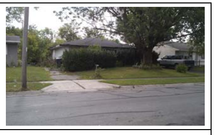
Overgrown shrub in front of vacant home with caving roof – poses a hazard.