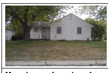
Many homes for sale or for rent in the area.