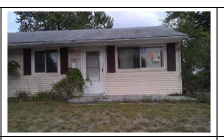
Residents in this area have dealt with a lot of long term vacancies.