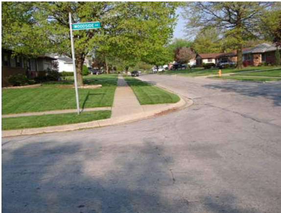
The lack of ADA ramps throughout the neighborhood makes it difficult for senior and disabled residents to navigate the neighborhood.