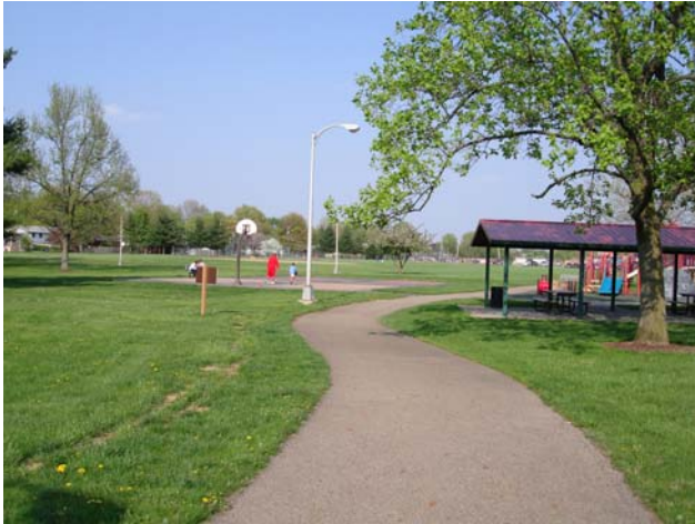
Woodward Park is a beautiful neighborhood asset.