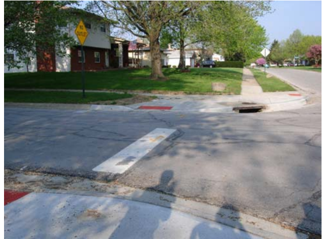
Better crosswalks near the park and school are need.