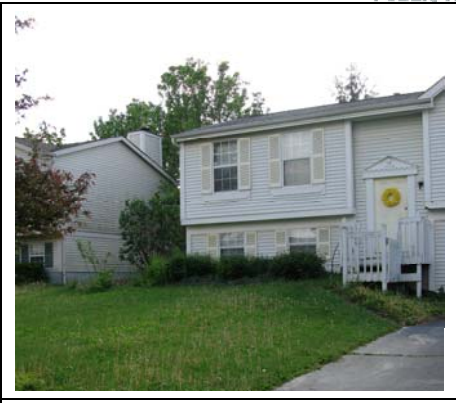
Another example of an unkempt lawn, possibly foreclosure