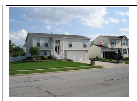
One of the most beautiful homes in the area