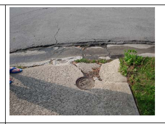
Broken water main lids throughout the neighborhood and missing ramps

Comments: While there are a few examples of aesthetic elements detracting from the good environment for walking, residents on the walk were quick to share success stories of community intervention around maintenance of homes and aesthetics. They could identify houses that the community came together around to ensure they were improved or taken care of or that neighbors in need were connected with assistance.