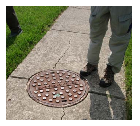
City swear cover damaged sidewalk