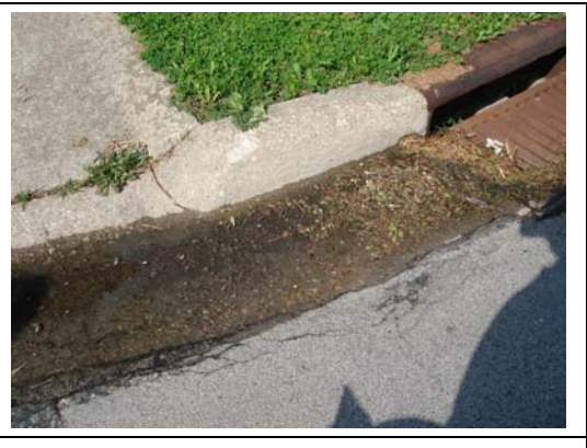
Drains backup with lawn and litter debris, causing smelly standing water