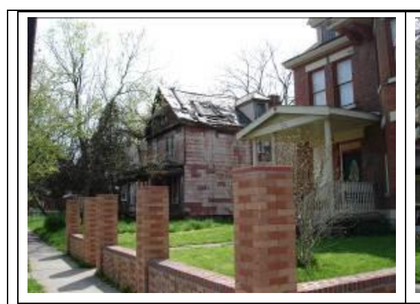
There are some beautifully maintained homes next to vacant homes that have fallen victim to arson