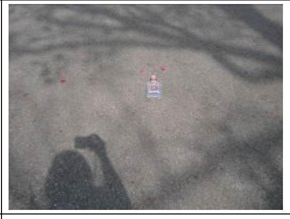
Litter found throughout all areas, empty alcohol bottles fuel perceptions of crime