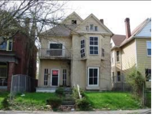
Vacant, city-owned buildings are distinguished by their plywood windows