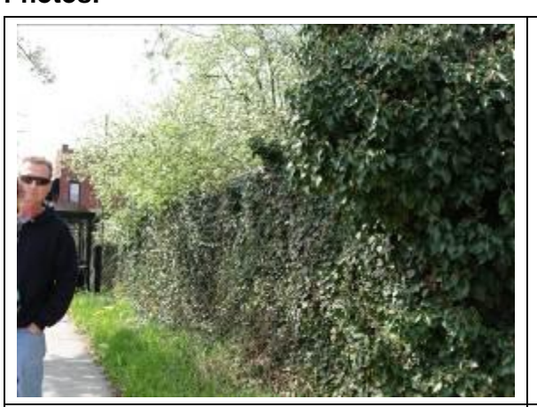
Bushes are overgrown in many places throughout the walking area