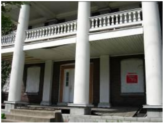
Vacant commercial buildings on Main Street