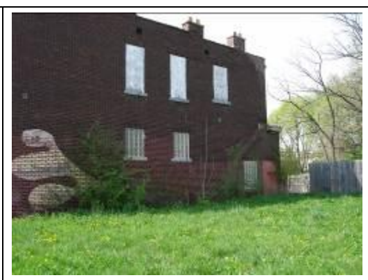
Open, vacant lots in commercial areas bring crime elements