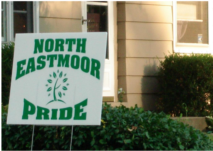
Block watch sign displayed in window.