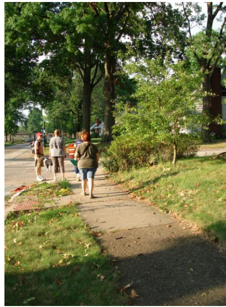
Bushes block the way for drivers to see around street corners.

Comments: This neighborhood has a neighborhood block watch and many residents display the signs in their houses, which could increase the perception of safety. The residents did not recommend walking north of Maryland Avenue because of concerns for personal safety. The lighting on most of the streets is bright enough for walkers and neighbors are outside. However, traffic can be unsafe on certain streets due to speed and obstructions.