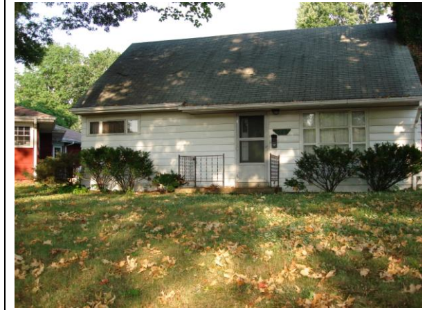
Well maintained yard and house.