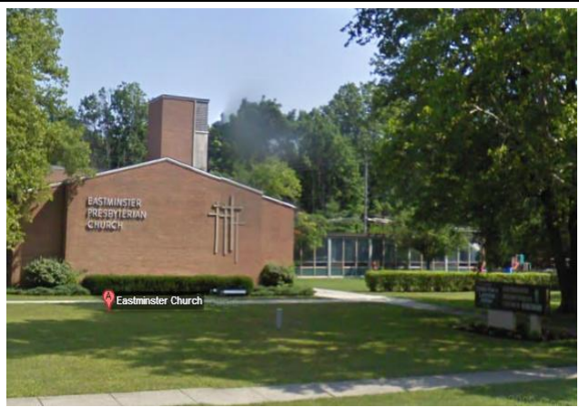
Eastminister Church

Comments: Neighbors have limited options, within walking distance, of buying groceries, however some residents do go to the Panera to meet friends. The Eastminister Church serves as a meeting place for the civic association and many of the community sponsored events.