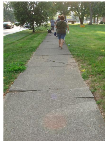
Cracked and uneven sidewalk