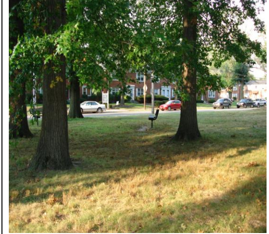
Playground at Broadleigh Elementary.