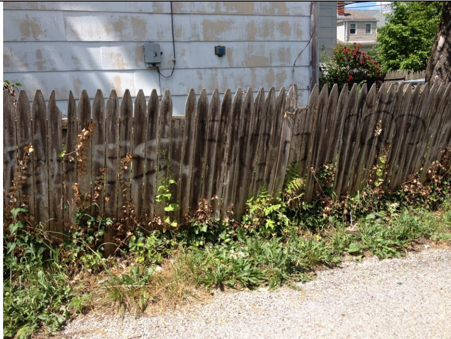
Graffiti along the fence.