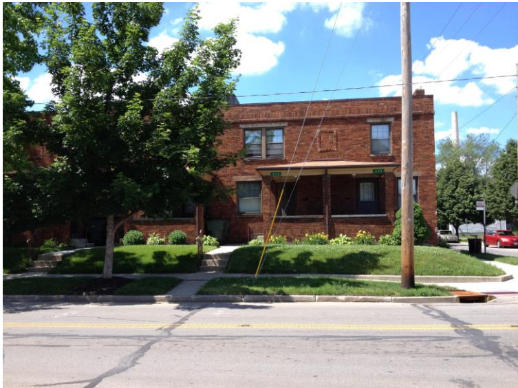
Nice shaded sidewalk.