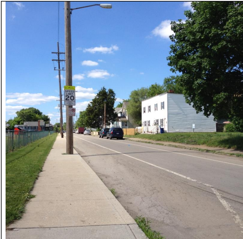
Tall automobile lighting.