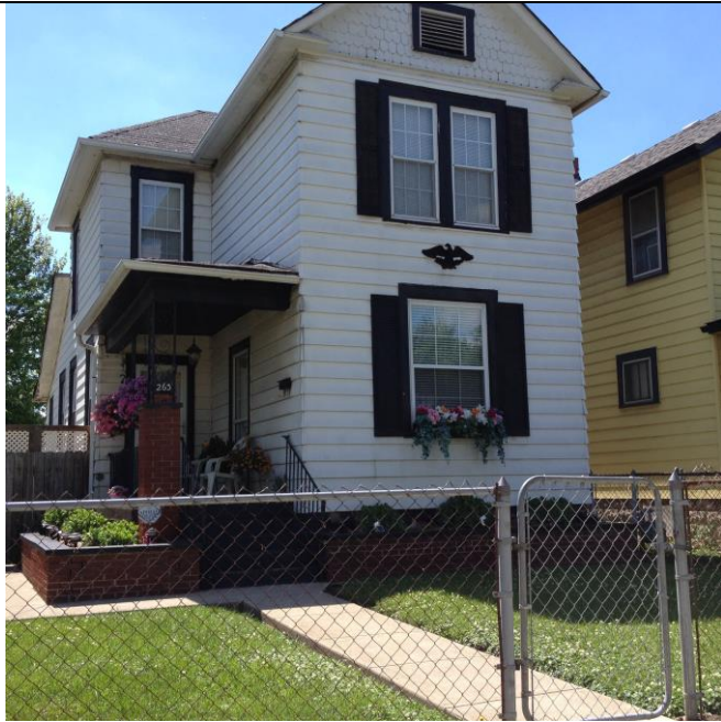
Well maintained house and yard.