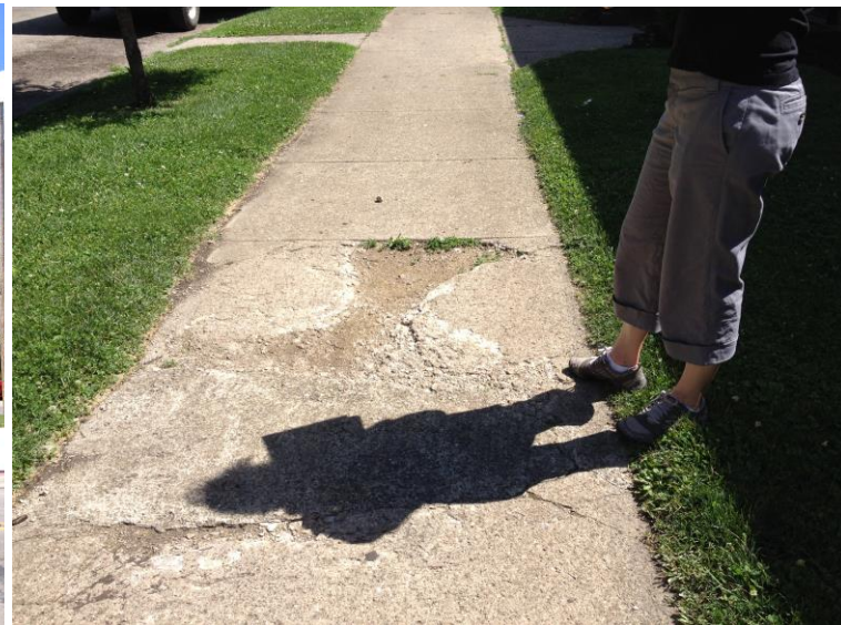
Hole in sidewalk.