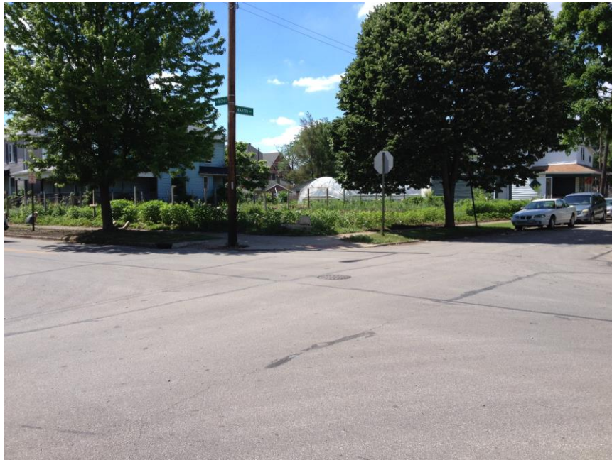
This is a picture of one of the gardens of Franklinton Gardens on the corner of Rich and Martin.

COMMENTS: Franklinton residents have the opportunity to walk to areas to obtain groceries, worship, and places to gather.