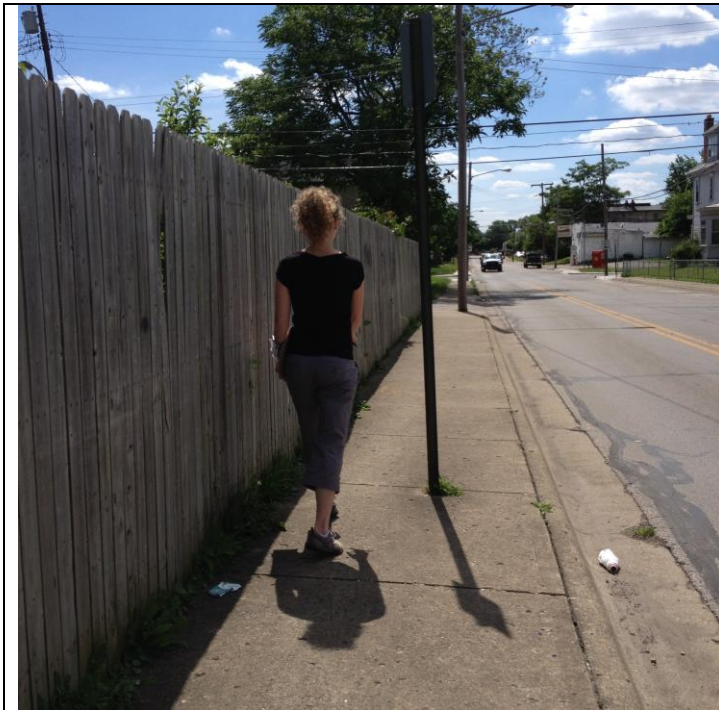
Post placed obstructing walkers in sidewalk.