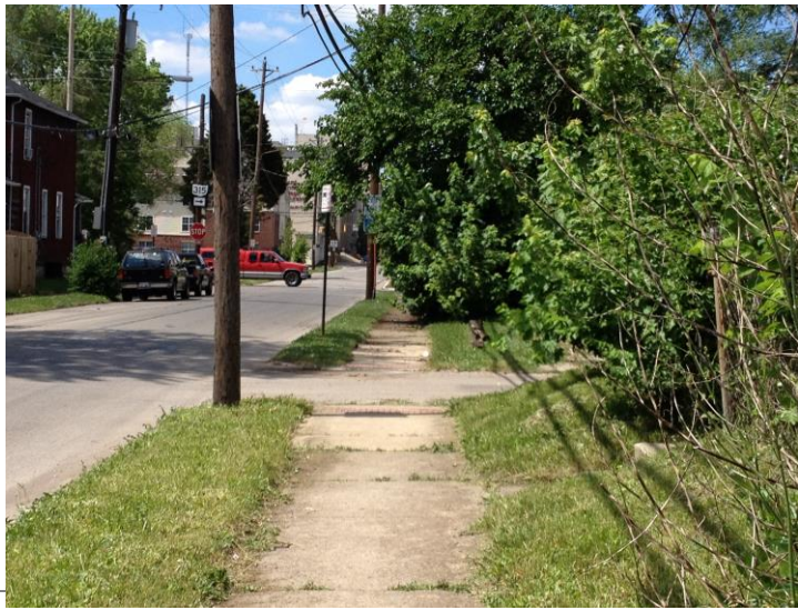
Overgrowth present on some sidewalks.

COMMENTS: There is great connectivity and most streets have sidewalks. In additional, there are ADA compliant ramps peppered throughout the neighborhood (many on Sullivant). It is a bit difficult to walk along certain sidewalks due to overgrowth from vacant lots, litter, and cracked sidewalks.