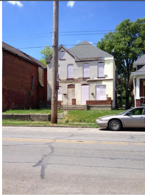
Boarded up house.