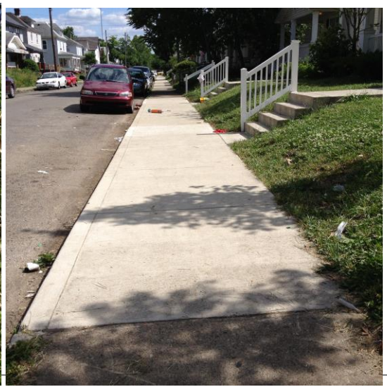
Nice sidewalk with shade but litter is present.