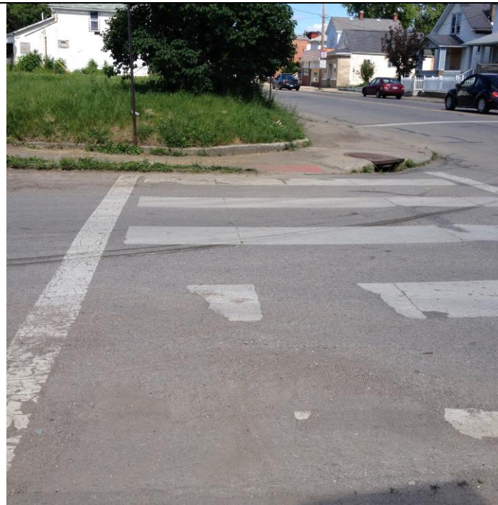
Crosswalk near school on Princeton-needs to be re-painted.