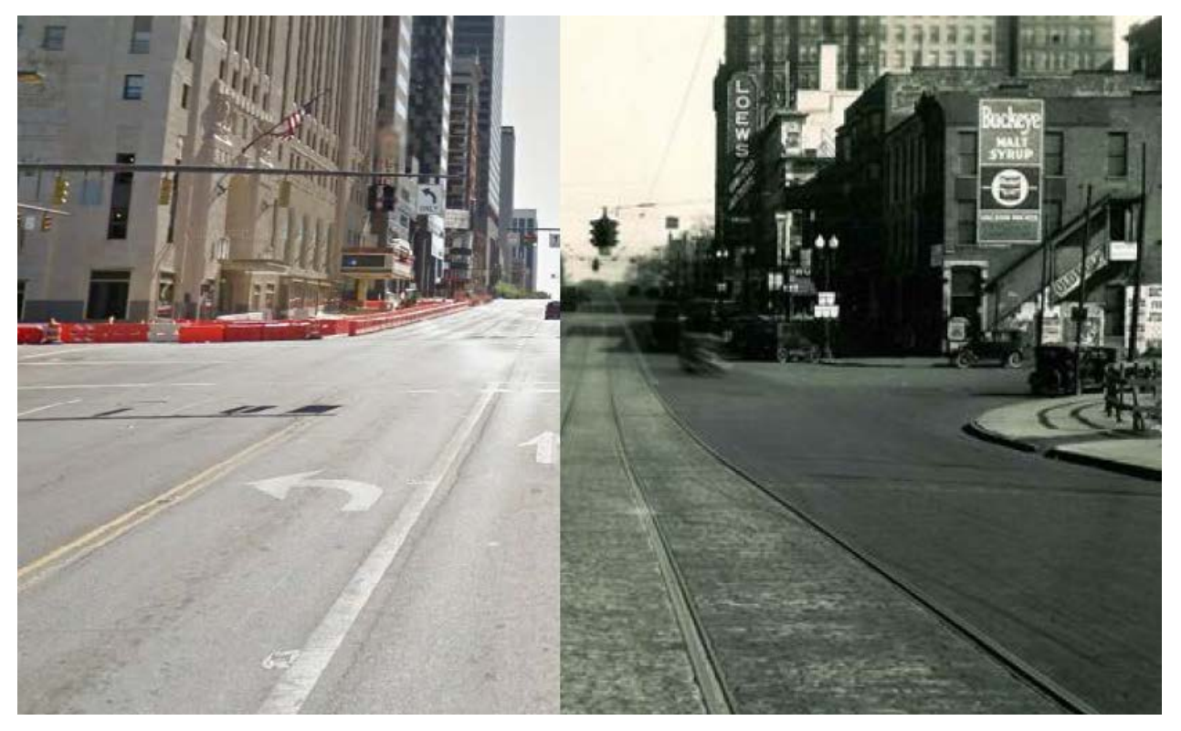
Looking east on Broad Street in 2015, left, and the same view in the 1920s, right.