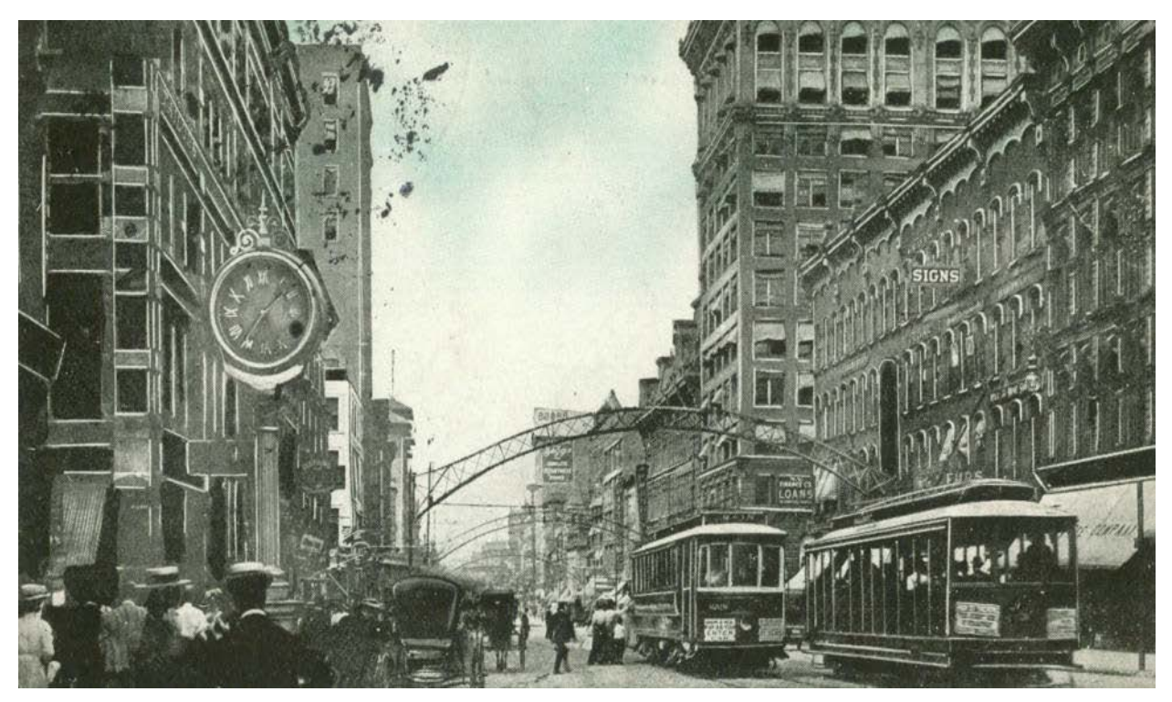
Black and white postcard of North High Street in 1913, published by the Novelty Shop. The postcard features the Atlas Building on the right.