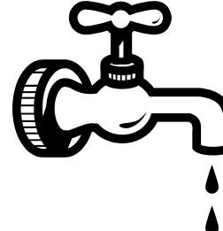
1/8 inch Flow

23,333 GALLONS PER MONTH $214.71 Per Month