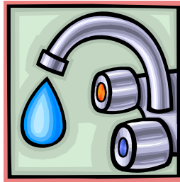
1/16 inch Flow

6,000 GALLONS PER MONTH $55.21 Per Month